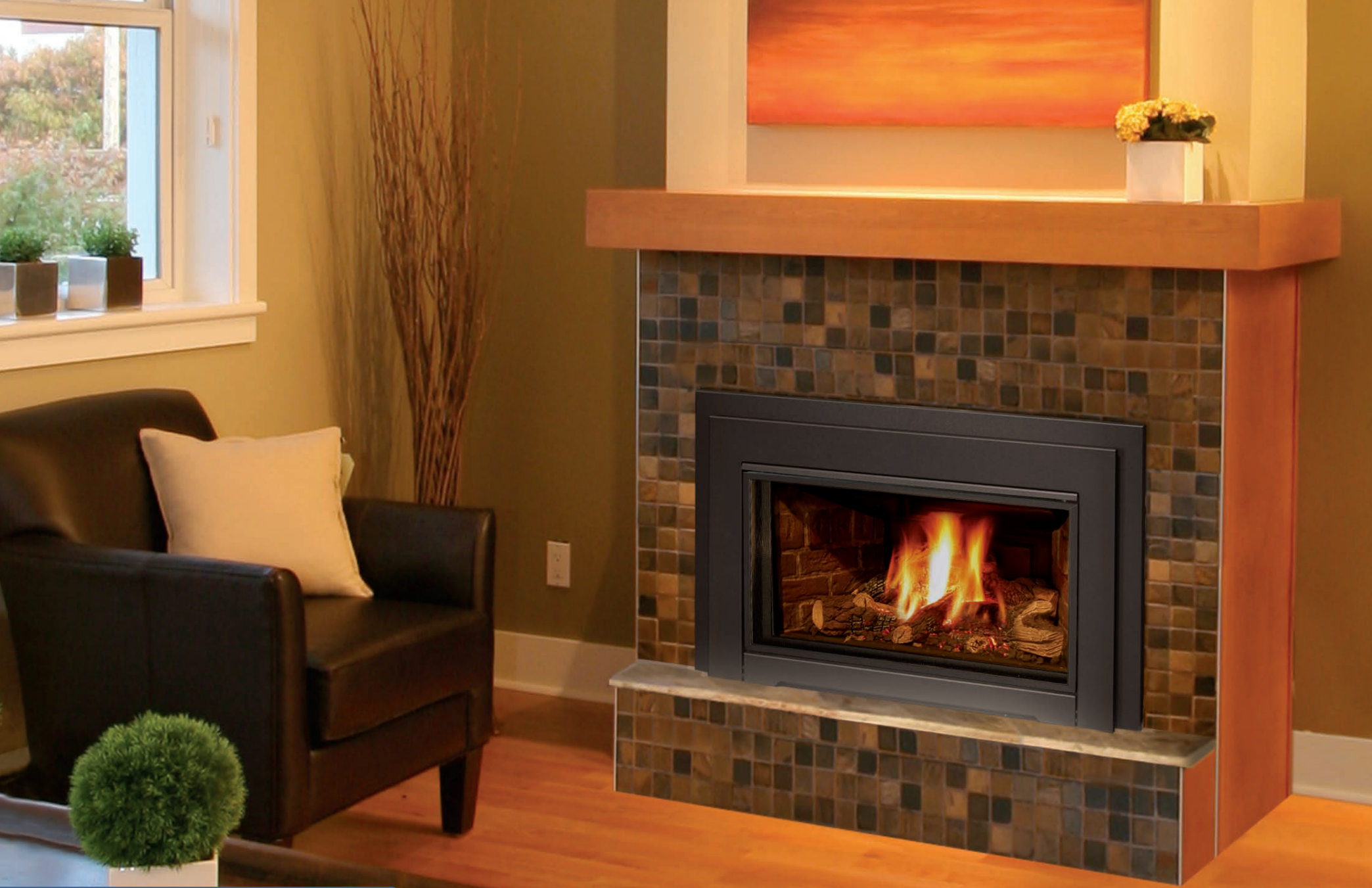
THE EG31 GAS FIREPLACE INSERT