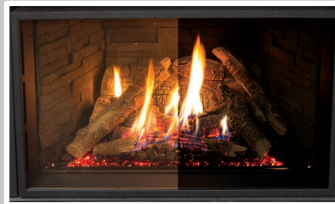
FIREBOX LIGHT ON/OFF

These lights can highlight your fireplace all year round.