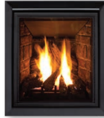
4-SIDED MINIMAL SURROUND