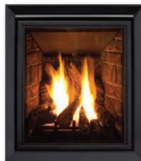
4-SIDED MINIMAL SURROUND